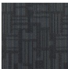
Blue Moon 62486 LRV 3.7