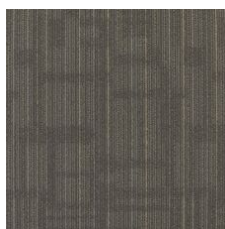
Moonstone 62500 LRV 6.3